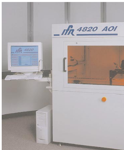
4800 series ATE Systems