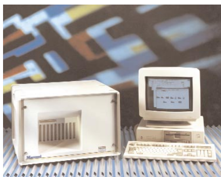
51X series ATE Systems